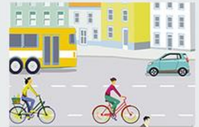
Housing in Transportation Planning